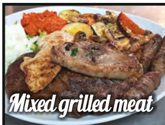
Mixed grilled meat