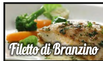
Filetto di Branzino