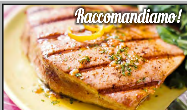
FILETTO DI TONNO

Quando siete a Dubrovnik mangiate dove mangiano paesani..!