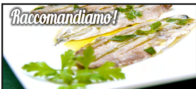
ACCIUGHE MARINATE, RUCOLA