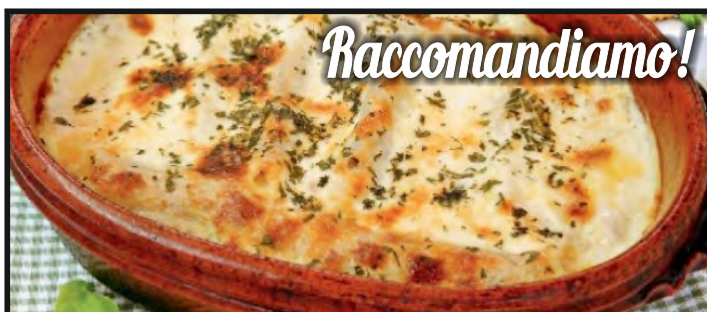
LASAGNE CON CARNE (pasta, carne macinata, bechamel)