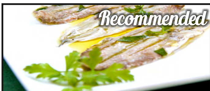
MARINATED ANCHOVIES, RUCOLA