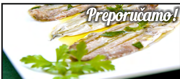
MARINIRANI INĆUNI, RIKULA