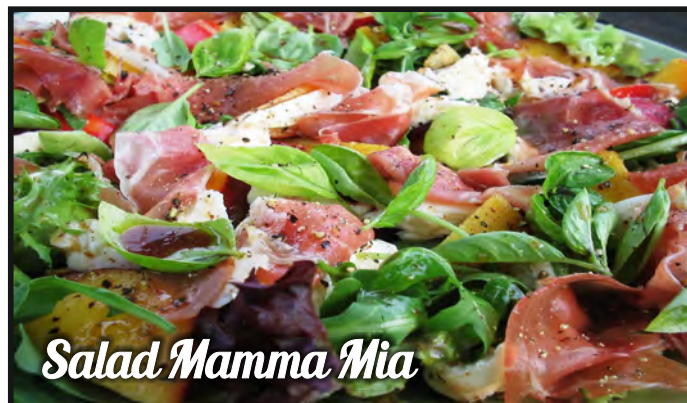
Salad Mamma Mia