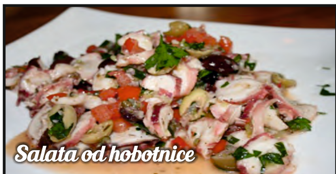
Salata od hobotnice