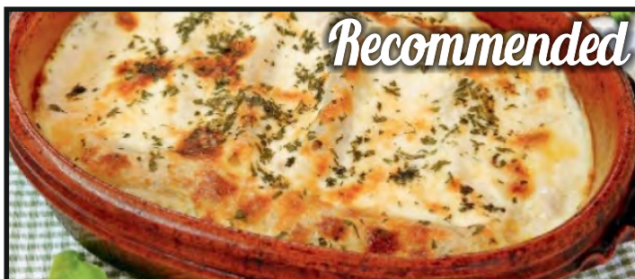
LASAGNE with MEAT (pasta, minced beef, bechamel)