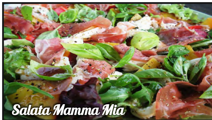
Salata Mamma Mia